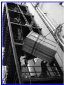
Figure 2-2 Moving Equipment Without a Freight Elevator

If your company site doesn't have a suitable freight elevator, you might be forced to take drastic measures to bring large equipment in and out. Figure 2-2 shows workers raising a backup tape library six stories above the ground with ropes and pulleys, for its installation into a Data Center in Bangalore, India.